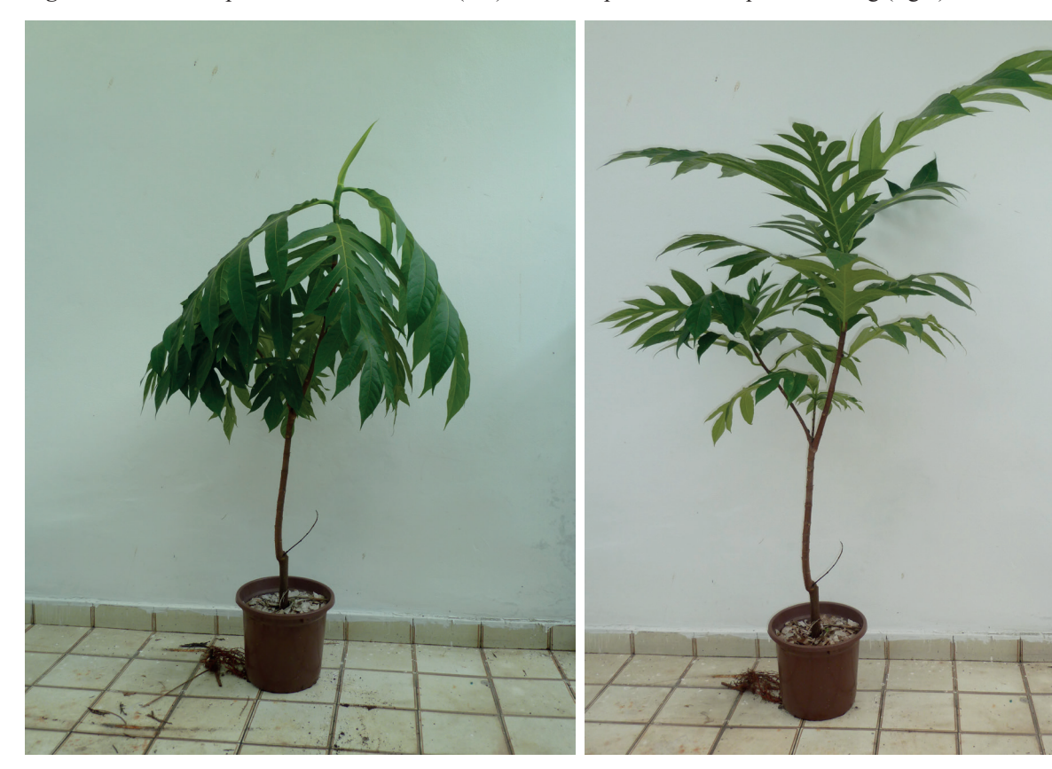
Figura 3. Breadfruit plant with lack of water (left) and same plant after adequate watering (right).

It is mistaken to plant the tree just somewhere in a field, as most of Amazon's upland soil is too poor in nutrients for this species (Figure 4 left). To avoid this, we explained this aspect and asked to see where it was going to be planted. If the indicated spot did not convince, no plant was given. Breadfruit is typically a backyard tree, where it can profit from water and receive household refuse as a form of fertilization. In Amazonia, many peasant farms have the toilet outside the house (OLIVEIRA et al. , 2020, Figure 3). Planting the tree close to such a bathroom gave good results.