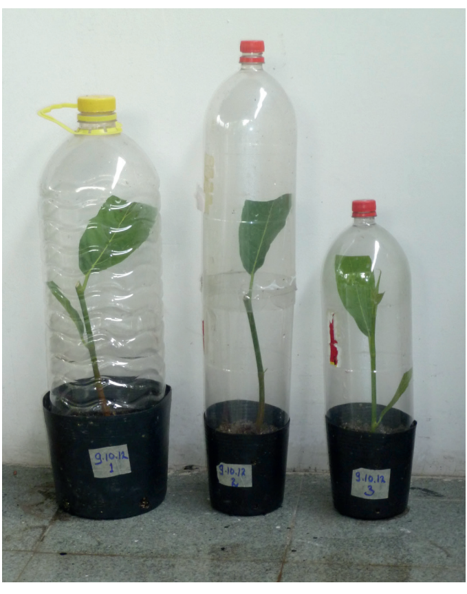
Figura 2 . Breadfruit cuttings in mini-greenhouses made of PET-bottles. A mini-greenhouse using: two 5-liter bottles (left); two 2-liter bottles (center); one 2-liter bottle (right).

rage, the removed bottoms were placed in a reverse position in the underside of those bottles.