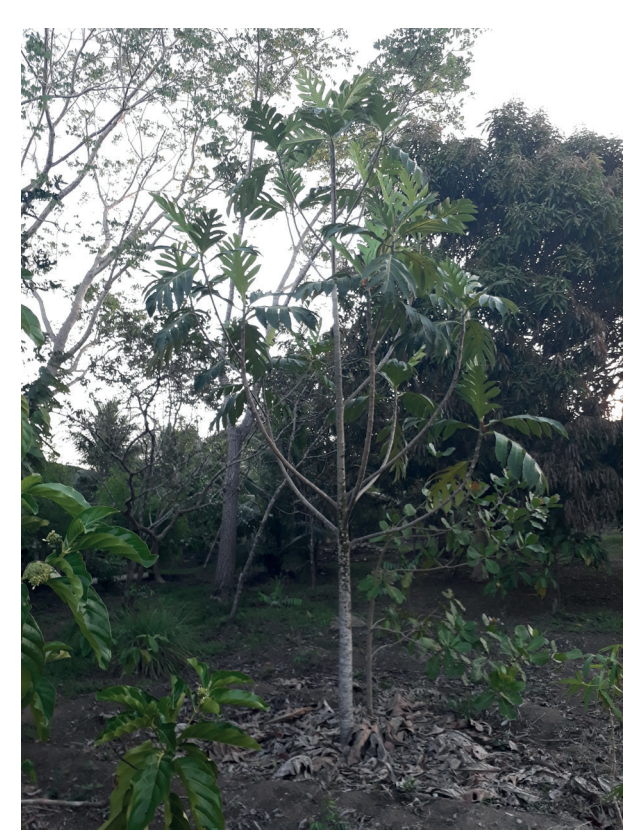
Figura 4. Breadfruit tree on soil poor in nutrients (left) and breadfruit tree on Indian Black Earth (right).

Being a large tree with strong roots, it should not be too close to the house, as its roots may affect its structure (GOEBEL, 2004). To avoid accidents, it should also be in a place where people do not often circulate (a heavy fruit might drop suddenly, even on a windless day). Particularly good results occurred with trees planted close to horticultural fields. The neighboring tree clearly profited from the irrigation and fertilization occurring there. Planting in Indian Black Earth also gave good results (Figure 4 right).